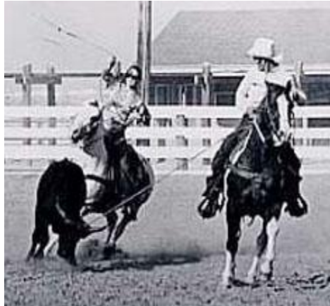
Skippa Rope heeling