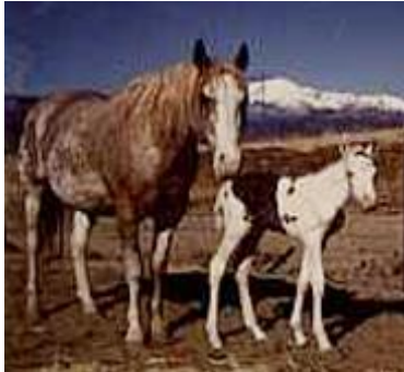
Baby Doll McCue & Skippa Rope